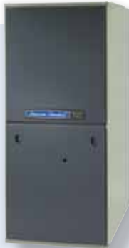
Platinum ZV Freedom® 95 Comfort-R™ Variable-Speed, Modulating, Communicating

Our most efficient and powerful gas furnace just might be our most comfortable too. With AccuLink™ communicating capability, continuous Comfort-R™ mode and an array of other innovative features, the Platinum Series gives your home maximum efficiency with controlled comfort.