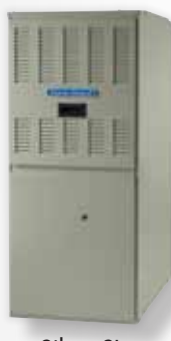
Silver SI American Standard 90