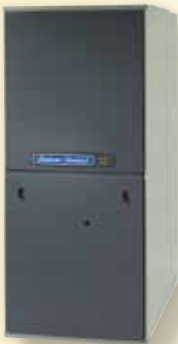
Gold ZM Freedom® 95 Comfort-R™ Variable-Speed

High quality and high efficiency mean a high standard of comfort for your home. The Gold Series offers just that. Whether you choose variable-speed technology, or a single-stage offering with the power to increase your overall system efficiency, you can be sure that each one contains American Standard's quality craftsmanship.