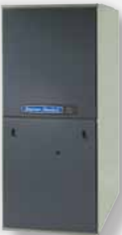
Silver ZI Freedom® 95 Single-Stage

Designed with value in mind, the Silver Series provides you with the comfort you want, the efficiency and durability you need and, of course, the American Standard commitment to quality you expect.