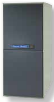
Gold XI High Efficiency Single-Stage