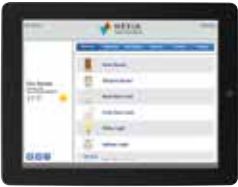
The Nexia Bridge, the hub of the system that connects devices to the web portal