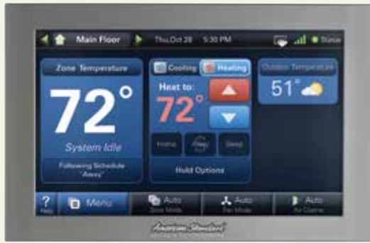
AccuLink™ Platinum ZV Control Model No. – AZONE950AC52ZA