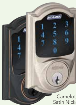
Camelot Satin Nickel