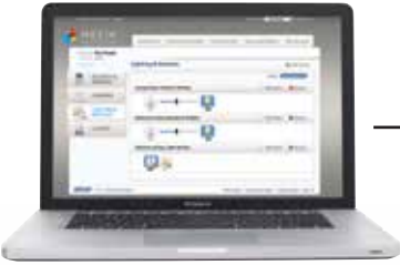
Schedule front porch light to turn on automatically