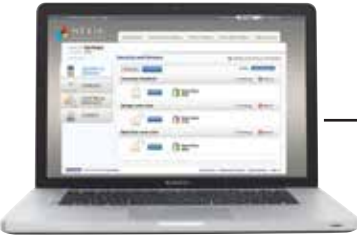
Get text or email alerts when a window or door has activity or movement