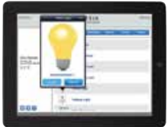
Turn lights on, off or dim them remotely