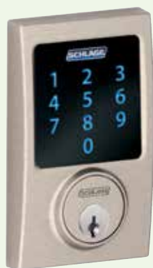
Century Satin Nickel