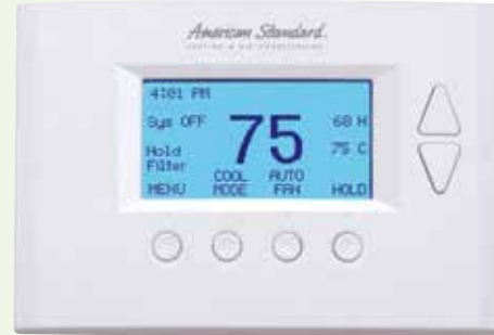
AccuLink™ Control Model No. – AZEMT500BB32MA